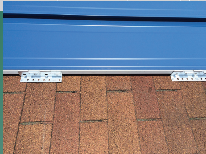
Clip seated on two shingles with fasteners through lower ends of the shingles.