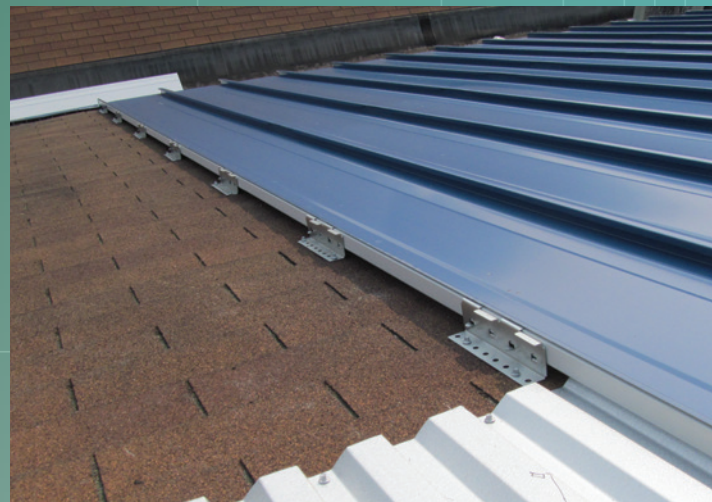
Corrugated sheeting installed at the ridge allows for continuous air flow between the existing and new roof while providing support for the panel and closure.

*The Department of Public Health and Environment has issued a policy position that asphalt shingles no longer will be considered a recyclable material. The department is concerned because only one one-hundredth of 1 percent of the waste shingles stockpiled for recycling in 2014 were actually recycled. According to the department "It was apparent from the information provided by the asphalt shingle recycling industry that end-use markets for recycled asphalt shingles are currently extremely limited" – Source – National Roofing Contractors Association (NRCA)